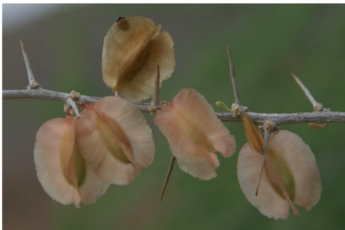
Figure 6. Phaeoptilum spinosum branch with branch tips modified into spines and reddish fruit with parchment-like wings.

GERMISHUIZEN, G. & MEYER, N.L. 2003. Plants of southern Africa: an annotated checklist. Strelitzia 14: 749–750. National Botanical Institute, Pretoria.