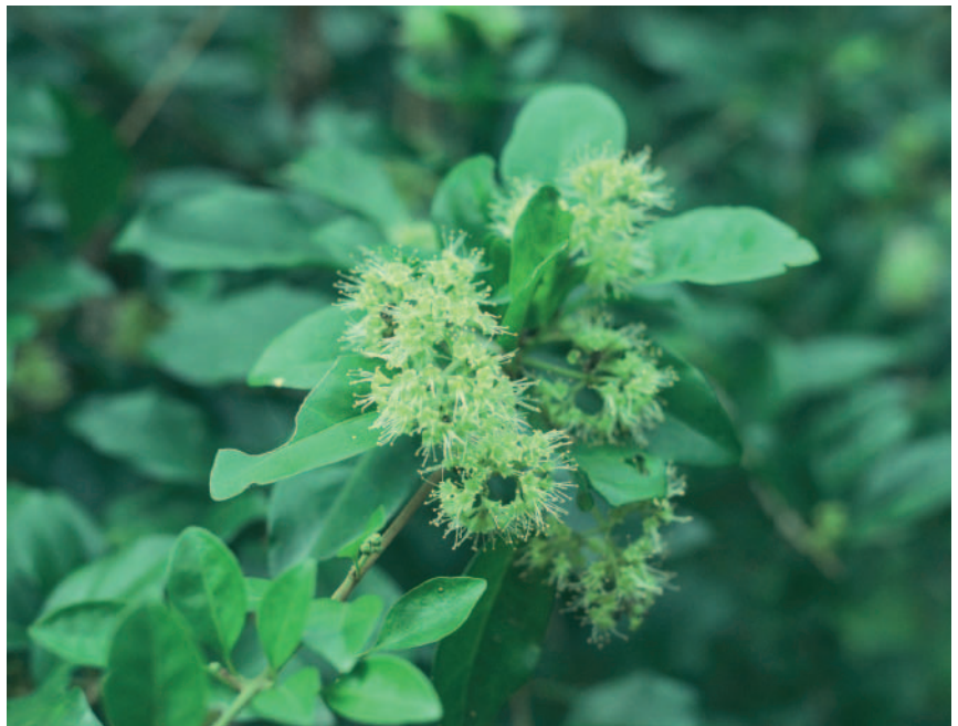
Figure 7. Creamish-green flowers of Pisonia aculeata .