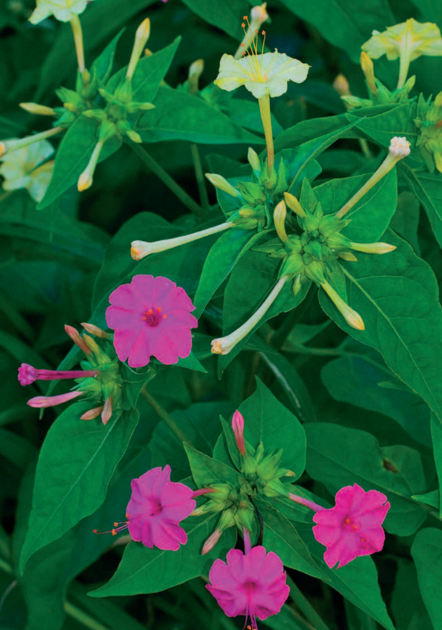
Figure 5. Mirabilis jalapa .