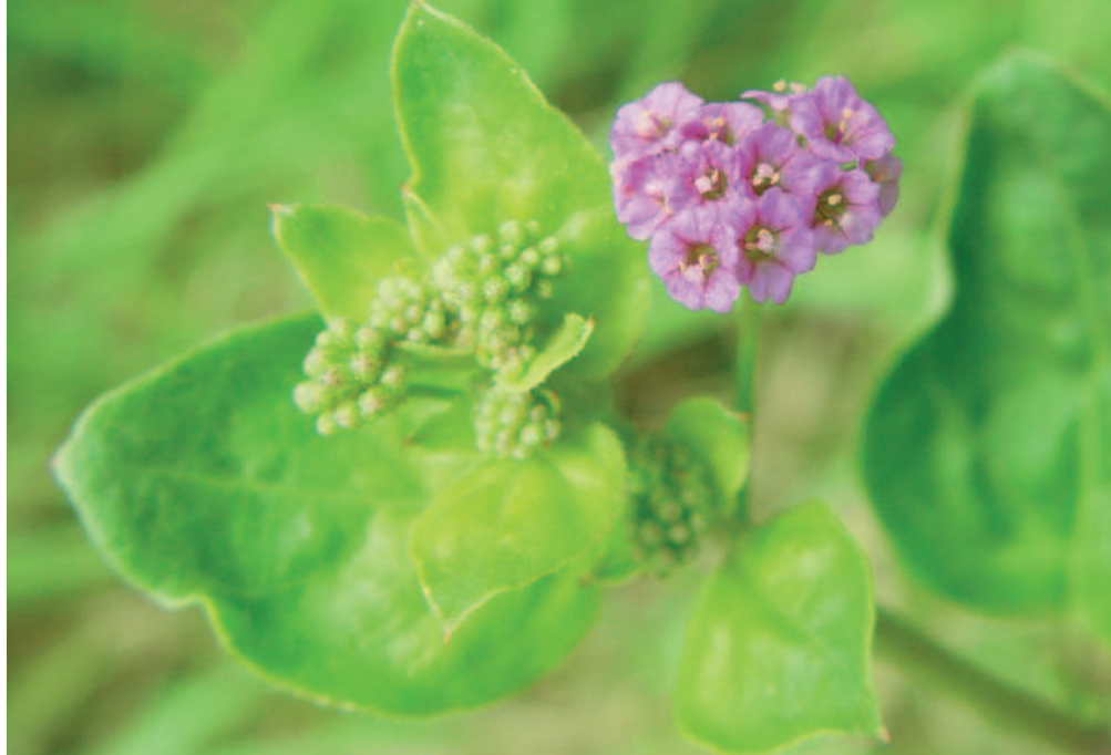
Figure 3. Purple, campanulate flowers of Boerhavia .

So please, look out for the Four-O'Clocks next time you go awandering! Remember, the weedy types are also very common in urban areas.