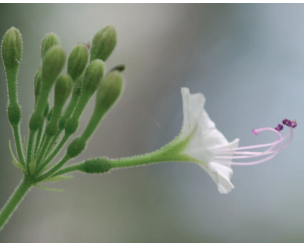
Figure 4. White, funnel-shaped flowers of Commicarpus plumbagineus .