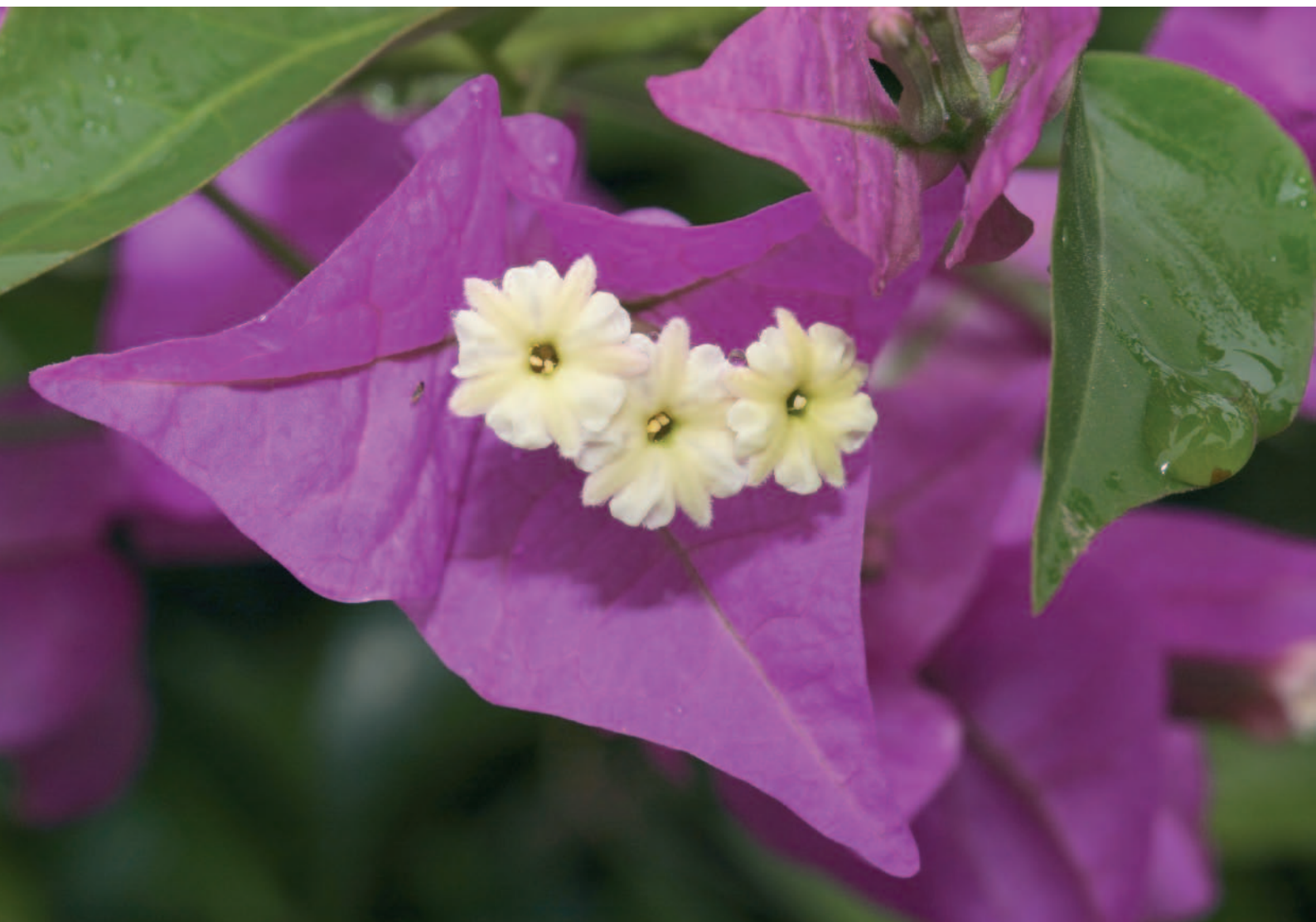
Figure 1. The inflorescence of Bougainvillea spectabilis enclosed by purple bracts.

The family is readily used as medicine in Asia, Brazil and Mexico to treat dysentery, diarrhoea, muscular pain, abdominal colic, and as poultices for boils, abscesses and scabies (Aoki et al. 2008; Hiruma-Lima et al. 2000). In southern Africa, roots of some indigenous species are